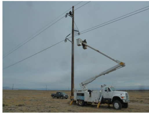
Transmission line construction