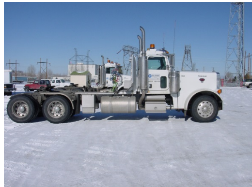
Heavy haul tractor