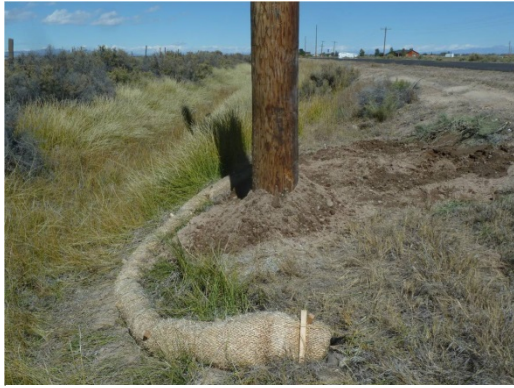
BMPs for construction near wetlands