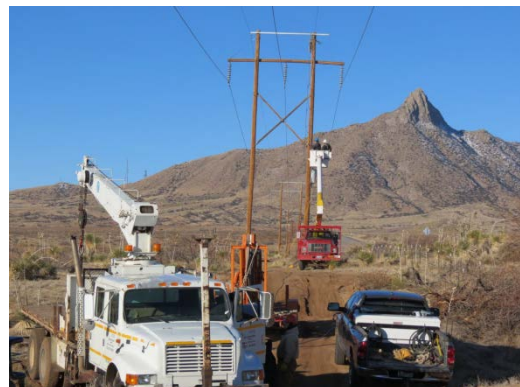
Transmission line construction