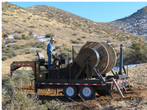
Cable reel/pulling location