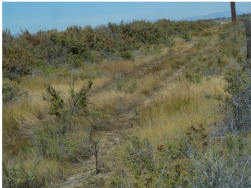
Overland travel route (no road improvement required)