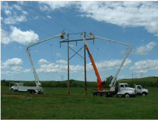
Transmission line construction