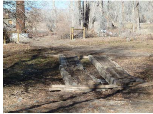
Timber mats for access in riparian area