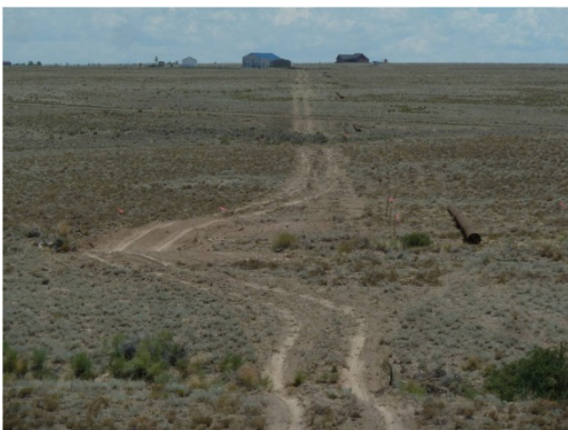
Two-track access road