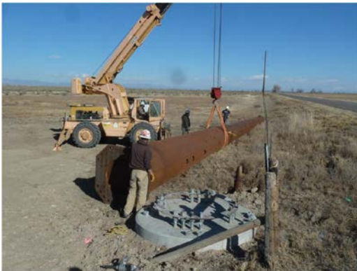
Setting structure on foundation