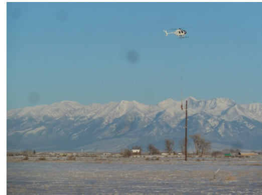
Conductor stringing with helicopter